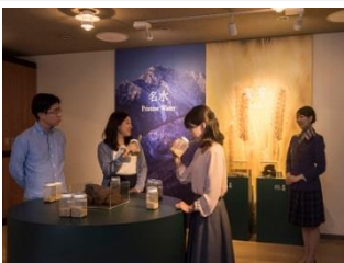
Please enjoy its taste and smell !