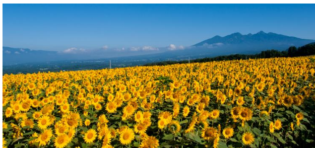
There are six hundred thousand Sunflowers in Akeno Sunflower Festival. You can enjoy Sunflowers spread out on the field