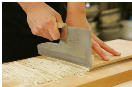
Let's make "SOBA" Japanese traditional food by yourself. And taste how delicious it is.!