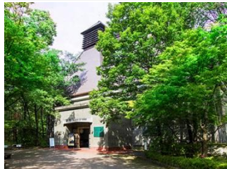
You can have look at the exhibition in the museum before the Factory tour.

In the beginning we introduce the craftsmen's dedication to producing a variety of distinctive whiskies at the Hakushu Distillery, then later you can taste the unblended whisky (not for sale) that makes up Hakushu Single Malt Whisky. This tour truly allows you to fully enjoy the whisky.