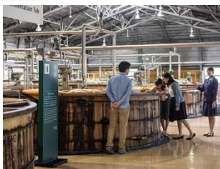
Hakushu Distillery's use of a variety of processes and techniques from the mashing stage through distillation allows it to produce an array of single malt whiskies with a variety of characters.